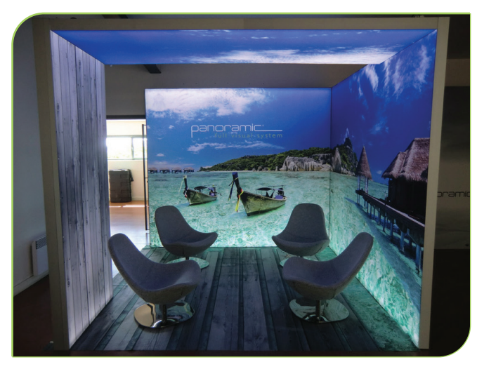
Custom backlit exhibits for 10x10 & 10x20 displays

Panoramic<sup>™</sup> is a solution 100% dedicated to your image.